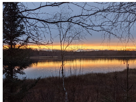
Photos from Fall Retreat 2021. The views from Camp Maranatha never disappoint.